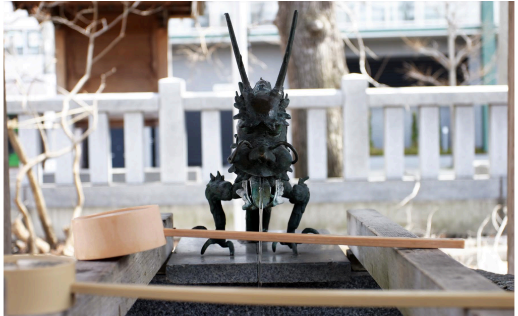
Shinto shrine purification water (temizu). Sapporo, 2010.