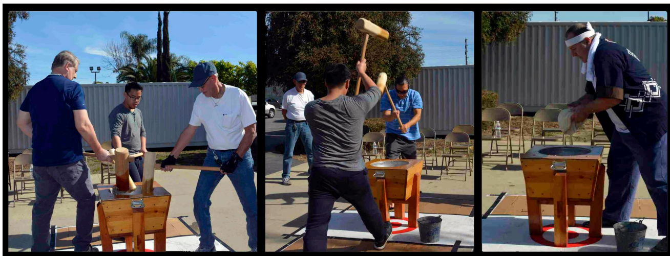
The first phase, second phase, and the final product

Mochi tsuki is the pounding of short grain glutinous sweet rice ( mochigome ) into large confectionary rice cakes ( kagami mochi ), medium size confectionary rice cakes ( komochi ), and small confectionary rice balls ( dango mochi ). Mochi cakes can be eaten fresh, or boiled at a later date inside New Year soup, warmed up and eaten with various toppings, or filled with some type of filling ( mochigashi ). The mochi rice is steamed then pounded or crushed repeatedly while inside a large mortar ( usu ) using one or more pestle ( kine ) until all the lumps are crushed out. Once the rice takes on a sticky consistency, soft mochi is next formed into the desired size and type.