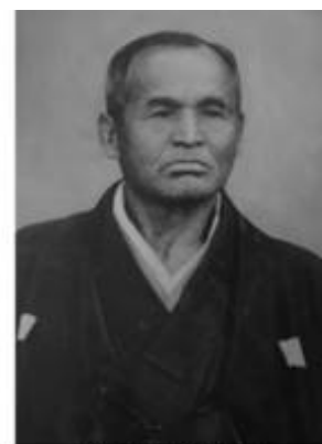
Takeda Sokaku (Aikijujutsu)

Ueshiba Morihei, a senior instructor under Takeda Sokaku who later founded “Aikido”, once performed a public demonstration in which Kano was present. It seems that Kano was impressed enough with what he saw to warrant dispatching a handful of his disciples, to include Tomiki Kenji and Mochizuki Minoru, to cross-train with Ueshiba. The most notable result of this cross training was the Judo “ Goshinjutsu no Kata ” (self-defense form), created largely from the influence of Tomiki in 1956. This Goshinjutsu no Kata contains fundamental jujutsu techniques clearly evolved from Daito-ryu Aikijujutsu.