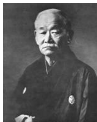
Kano Jigoro (Judo)

Since Takeda and Kano were born only a year apart from each other, it turns out that they spread their arts about the same time. The oral tradition ( kuden ) of Daito-ryu states Takeda Sokaku targeted adult government officials and other prominent people for instruction (especially military and police) at the recommendation of his teacher, who hoped that austere training in aiki would polish the character of those in positions of power. Kano, on the other hand, created Judo with the intent of targeting the world's youth, in hopes of improving their development. Both hoped to use their arts as a way of promoting world peace, either purposely or coincidentally while targeting the opposite generations.